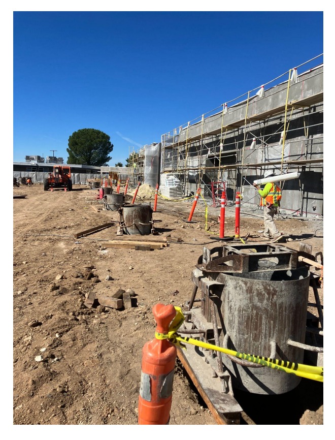
Skyblue Mesa Elementary Solar Project